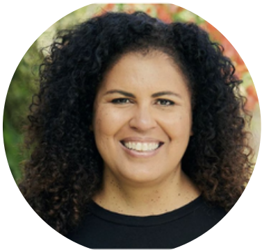
DR. SAFIYA UMOJA NOBLE